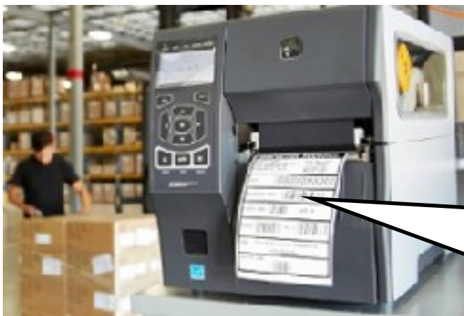
Foodlogik automatically prints bar-coded labels at goods-inwards

Stock Manager's intuitive screens enable you to gain on-line control of your stocks and traceability. When used in concert with Foodlogik's Purchasing and Goods Receiving module, Stock Manager provides a fully automated end-to-end stock control system with minimal additional staff training.