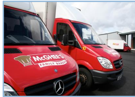
AND YOUR VANS